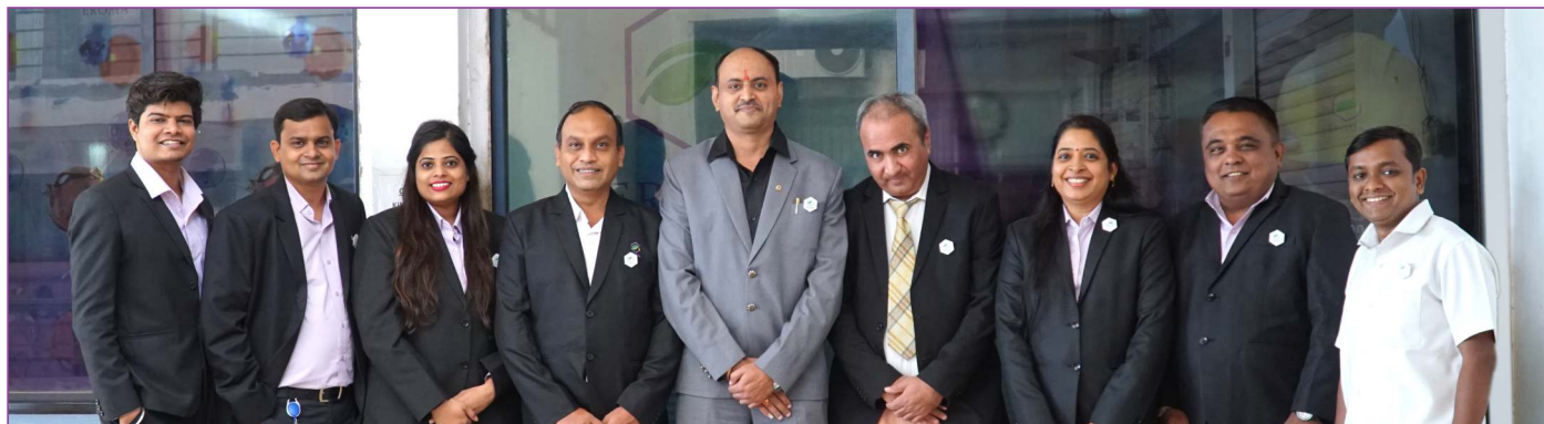
OUR DEDICATED TEAM